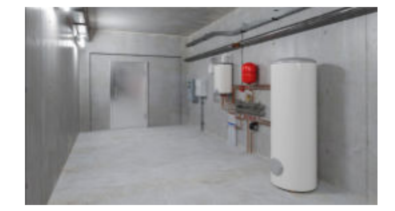
Introducing the sleek AURA HYBRID Heat Pump Water Heater by Plumbing Perspective