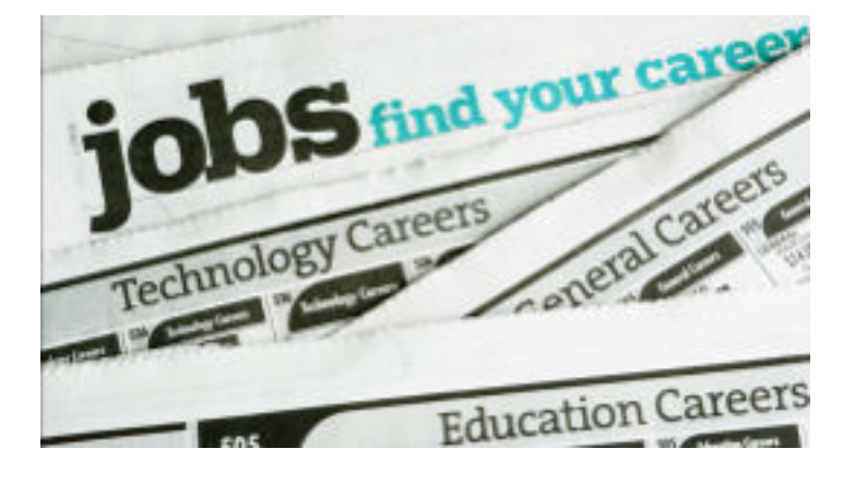
<u>Trade Jobs officially launches to help</u> <u>elevate employment in the home</u> <u>service industry</u>