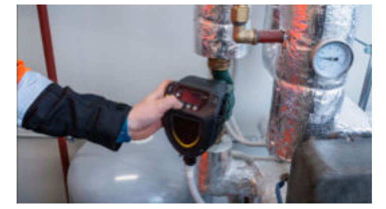
Top Tips for Combustion Analysis in Residential Heating by Plumbing Perspective

For more information about our products or newsletter, please reach out to us today at 818-436-2953 or info@leaktronics.com .