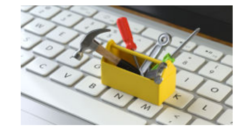
New Year, New Tools to Streamline Your Business Processes by Mechanical Hub Team