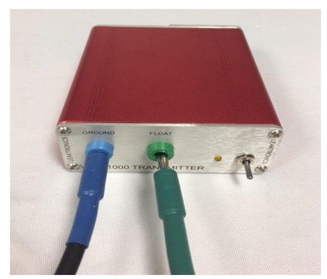
LeakTronics VILO Technical Manual

2) Using the LT1000 Amp and PoolScope, listen to all penetrations, step channels, lights, skimmers, main drains, side suction around lights, spas, etc. This procedure will find leaks or rule out these areas. This step cannot be done with the VILO.