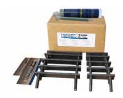
TL10 Price: $ 403.70

The Torque Lock<sup>™</sup> Staple is a revolutionary technique used to repair structural cracks on any solid cement based surface. Using its patented Cam Lock<sup>™</sup> technique, it stabilizes the concrete crack by creating up to 5000 lbs. of compression torque for each staple installed.