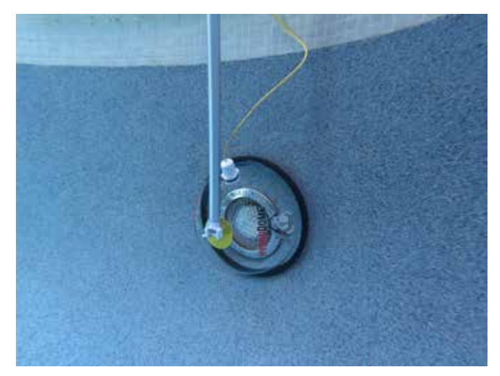
The electronic listening dome over a light.