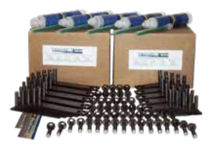
TL50 Price: $ 1,908.50

(15) 6-inch staples(15) 3-inch staples(3) Units EpoxyComplete Installation GuideTorque Lock Marking Template