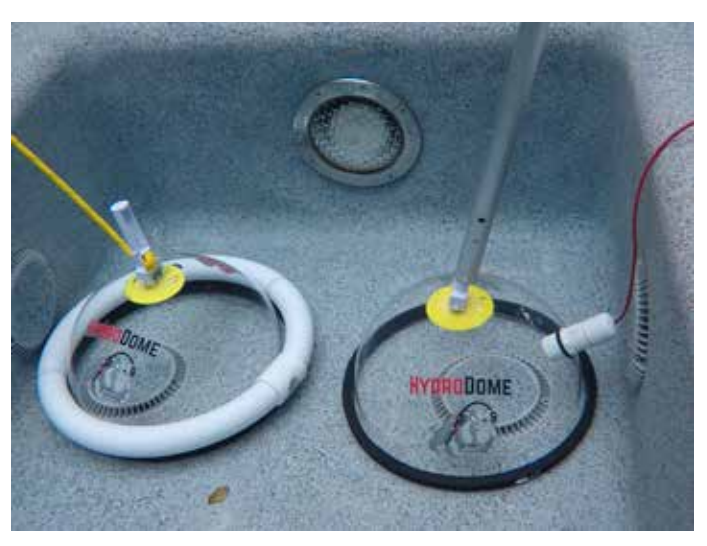
The listening and seal domes over a spa dual drain system.