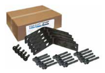
TLR-90 Price: $ 427.90

(5) 45° staples (15) Anchor Bolt Sets (5) Posts with Cams (1) Unit Epoxy Complete Installation Guide Torque Lock Marking Template